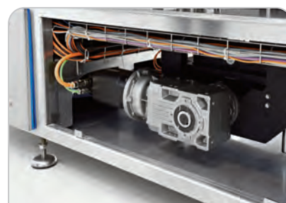
Electric lift mechanism