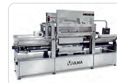
Accessibility and overall visibility