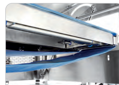
Quick disassembling belt for cleaning