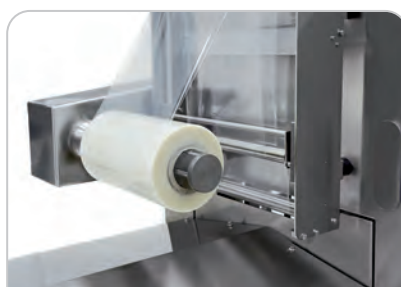
Pneumatic grip for reel holder