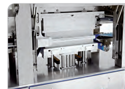
Easy cleaning surfaces